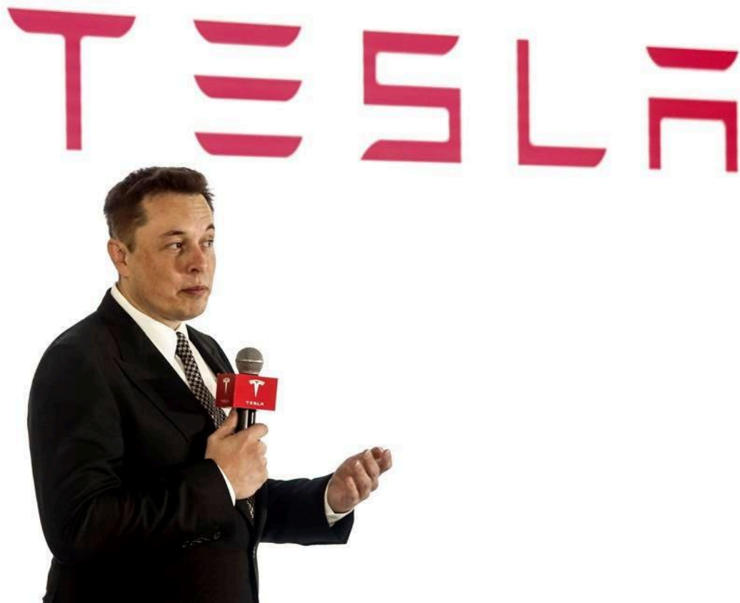
BEIJING, CHINA - OCTOBER 23: (CHINA OUT) Elon Musk, Chairman, CEO and Product Architect of Tesla... [+]

Musk has been discussing the potential of transforming Tesla cars into autonomous Ubers that can earn passive income for their owners since 2019. But he has now shoved all his chips onto the table. “If somebody does not believe Tesla will solve autonomy, they should not be an investor,” he declared, practically daring institutions obsessed with EV market share and margins to sell Tesla’s stock.